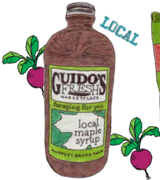
Our Own MAPLE SYRUP pints / all grades $12.99