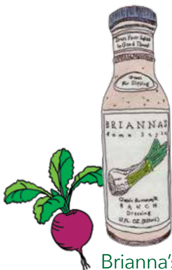
Brianna's DRESSINGS all varieties $2.99