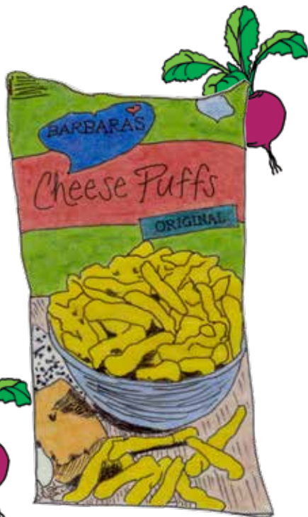
Barbara's CHEESE PUFFS all varieties 2/$4