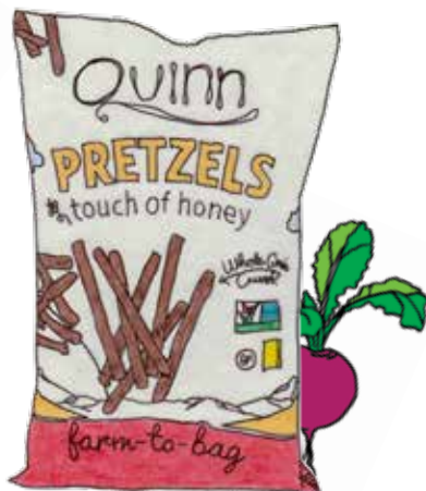
Quinn PRETZELS all varieties $2/$5