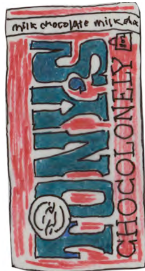
Tony's Chocolonely CHOCOLATE BARS all varieties 6 oz $3.99