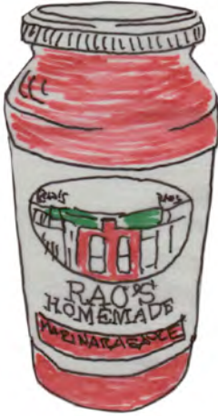
Rao's Homemade PASTA SAUCES all varieties 24 oz $6.99

There are over 450 products on sale in our stores in June, and we've picked our very favorites. Don't forget to look for the BEET all month long!