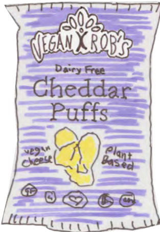
Vegan Rob's SNACKS all varieties 3.5-5 oz 2/$4