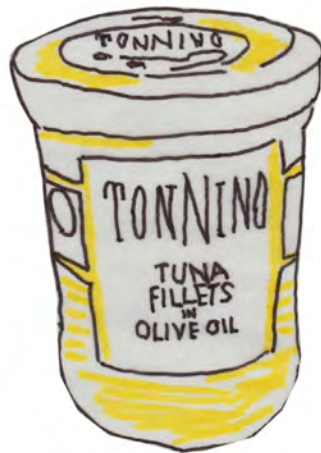
Tonnino TUNA IN GLASS select varieties 6.7oz $6.79