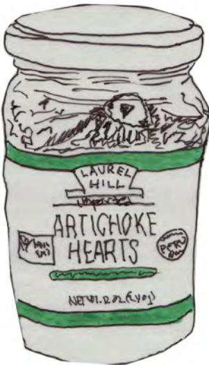
Laurel Hill MARINATED ARTICHOKE HEARTS 12 oz $2.99