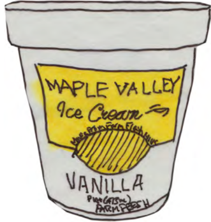
Maple Valley Creamery ICE CREAM all varieties 16 oz $3.99