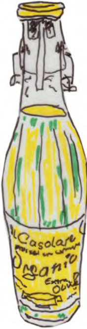
Il Casolare ORGANIC EXTRA-VIRGIN OLIVE OIL 750 ml $13.99